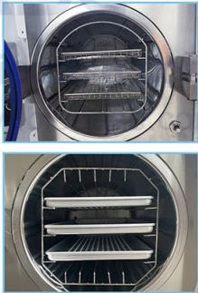
Stainless Steel Tray (Optional)